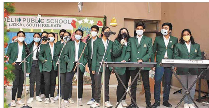
Students sing carols during a special assembly

The little ones from Nursery to Class II displayed their creativity by making their own Christmas tree, stockings, reindeer headgears and Christmas candy canes using easily available materials.